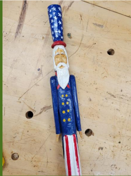
Detail of the cane carved by Dale Lott.